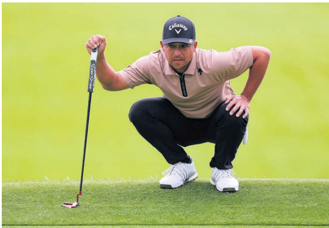
Xander Schauffele lines up a putt on the ninth green during the final round of the Genesis Invitational golf tournament at Riviera Country Club, Sunday, Feb. 18, 2024, in the Pacific Palisades area of, Los Angeles.

The PGA Tour already has held three of its "signature events" with a $20 million purse, cold plunges and wild-caught seafood served in player dining. Nothing felt extraordinary about them. LIV Golf had